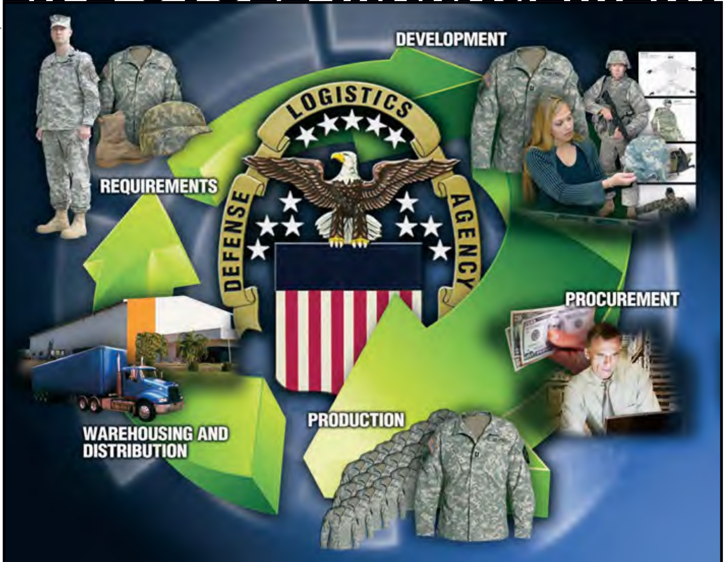
Defense Supply Center Philadelphia's clothing and textiles supply chain life cycle management process begins with establishing the military services' requirements, then moves into developing, procuring and producing the product, and ends with warehousing and distributing the product.