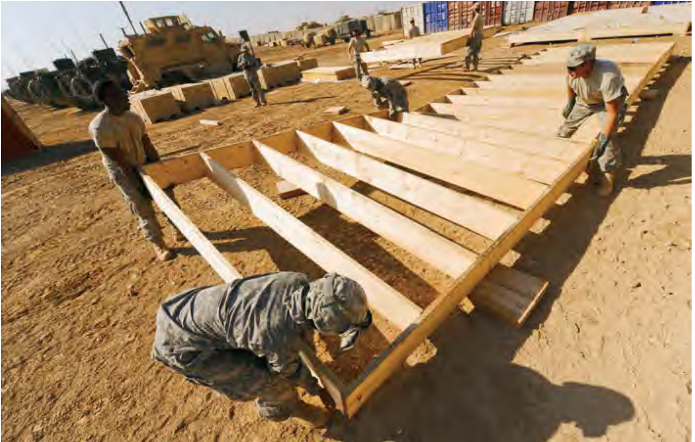
Soldiers work on a construction project at Forward Operating Base Price, in Helmand province, Afghanistan. The Defense Supply Center Philadelphia is sourcing the lumber builders need to keep pace with the increasing number of construction projects in country.